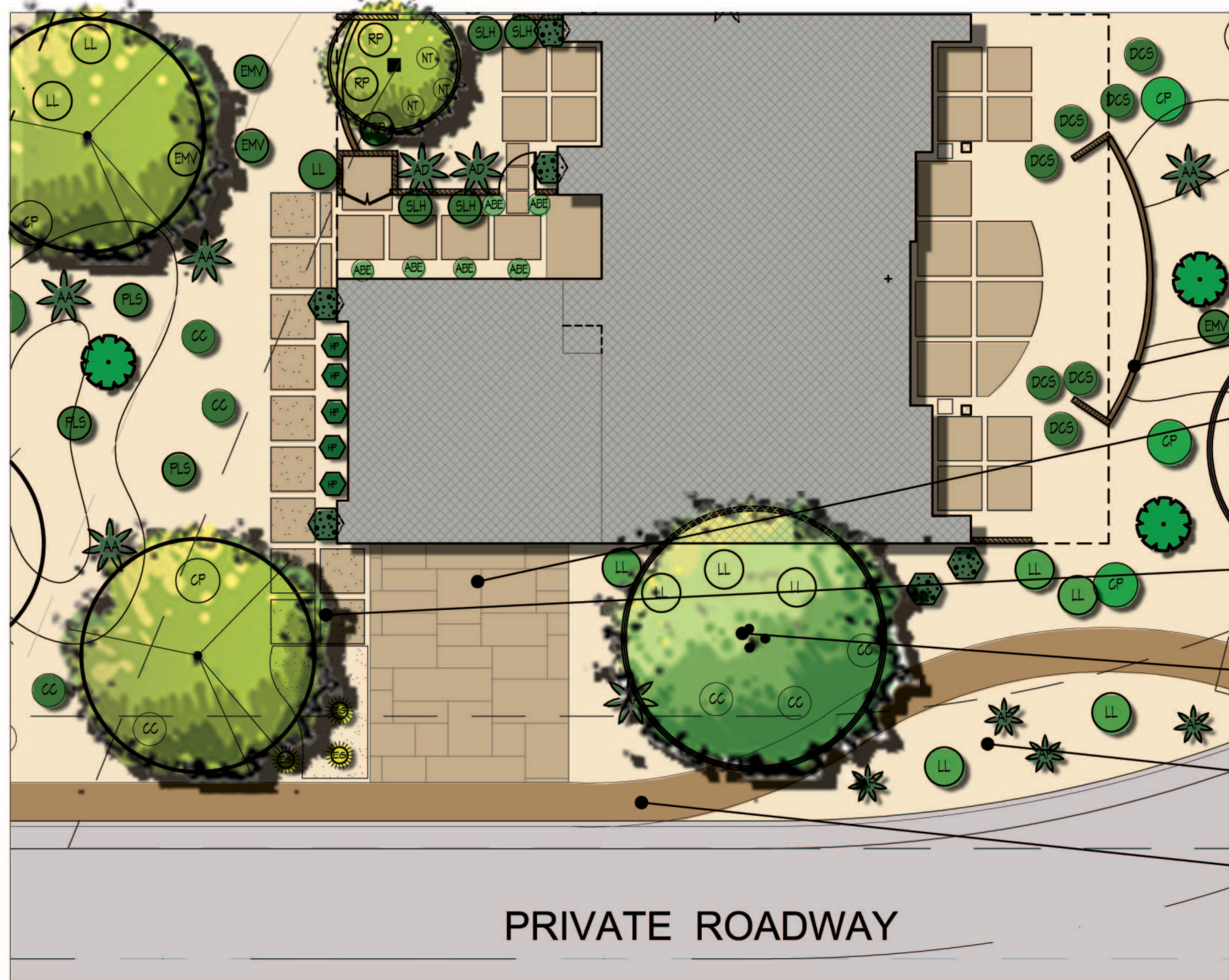
TYPICAL RESIDENTIAL UNIT SCALE: 1/8" = 1'-0"